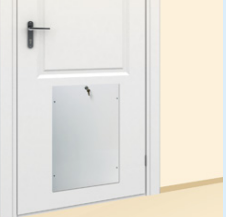
Steel Security Plate Installed

The steel security plate is included with each PD DOOR or PD WALL unit and can be installed when leaving your home for an extended period. If using the security plate daily, purchase the PlexiDor Sliding Track with Flip Lock accessory for added convenience.