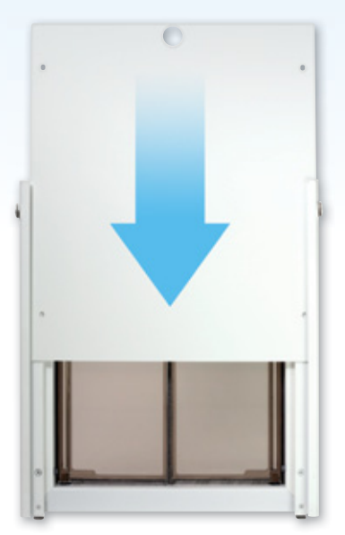
Security plate slides into place